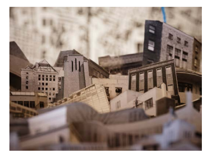
Photo: "The Secret Space: Palimpsest" installation in the National Archives.

Venue: National Archives, Bishop Street, Dublin 8. Dates: 18 May–30 June 2023 Opening hours: Monday to Friday, 10am–5pm