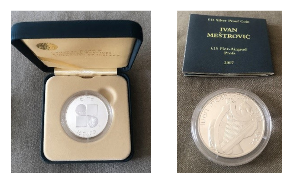
Photo: Commemorative Coin issued in 2007 by the Croatian National Bank and Central Bank & Financial Services Authority of Ireland.

In 2007, the Croatian National Bank in cooperation with the Central Bank & Financial Services Authority of Ireland issued a commemorative silver coin of the Seal's design by Meštrović (pictured below).[17]