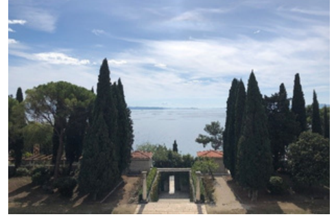
Photos: Meštrović Gallery in Split, Croatia.