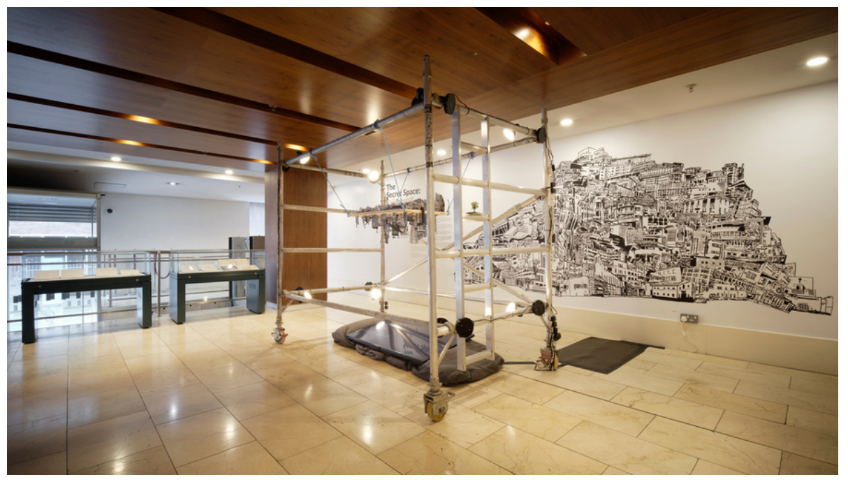
Photo: "The Secret Space: Palimpsest" installation in the National Archives.