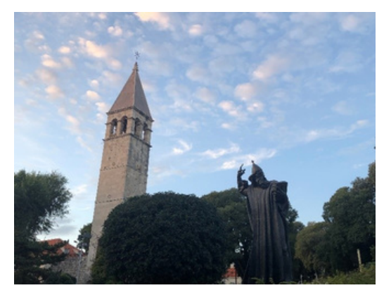
Photos: Meštrović Gallery and Statue of Gregory of Nin (Grgur Ninski) in Split, Croatia.