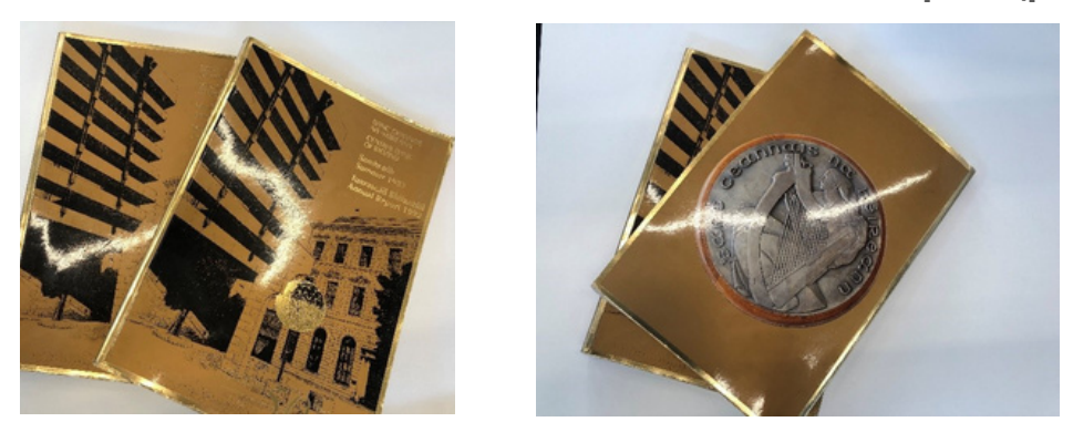
Photos: Annual Reports for the year 1992: Central Bank of Ireland Archive.

The Seal is currently used along with the Governor's signature on legal documentation, and has also been used as cover art on the reverse of annual reports (pictured below).