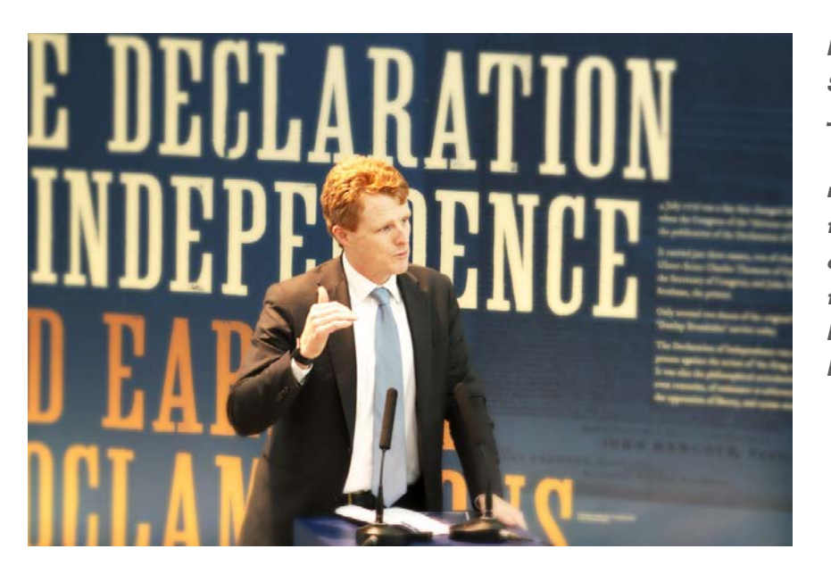
Photo: US Special Envoy Joe Kennedy at the launch marking the loan to PRONI of an original copy of the US Declaration of Independence.

PRONI kicked the centenary programme off in April with the launch of not one but two exhibitions. The first launch was an event showcasing the UK's signed copy of the Belfast (Good Friday) Agreement on 3 April. This was followed by a second launch on The Declaration of Independence on 20 April by US Special Envoy Joe Kennedy to mark the loan to PRONI of an original copy of the Declaration. Both documents have been loaned from The National Archives (TNA) in London.